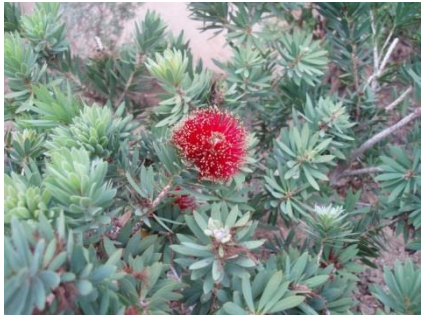
LITTLE JOHN BOTTLE BRUSH-FRONT OF OFFICE