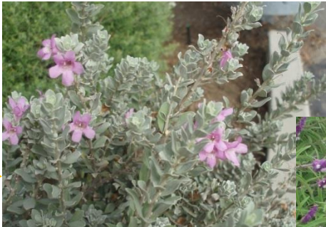
TEXAS RANGER ( LEUCOPHYLLUM )