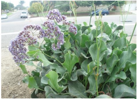
SEA LAVENDER-(LIMONIUM PEREZII) IN PLANTER-FRONT OF OFFICE