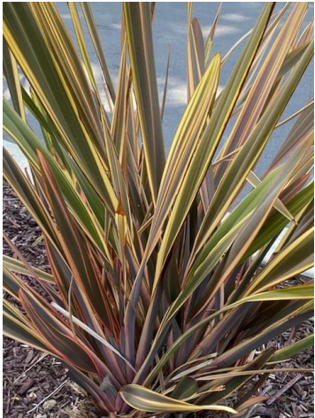
NEW ZEALAND FLAX-PHORMIUM TENAX