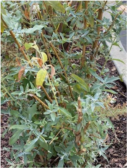
KOMULE DAVIDOVA-BUDDLEJA DAVIDII