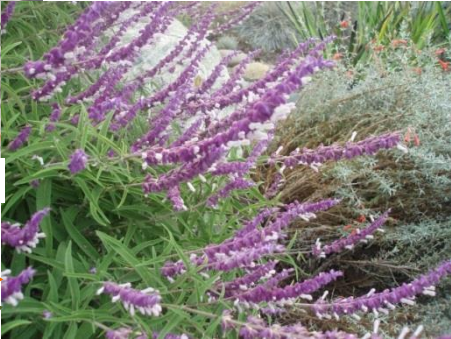
MEXICAN BUSH SAGE