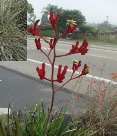
KANGAROO PAW ANIGOZANTHOS