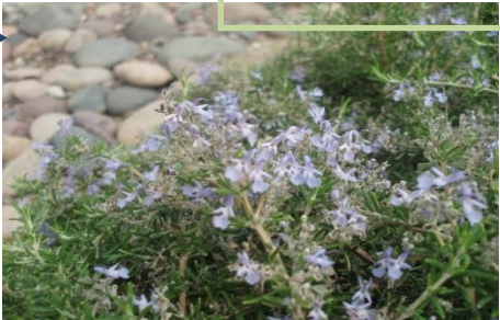
ROSEMARY PROSTRATUS; ROSMARINUS OFFICINALIS