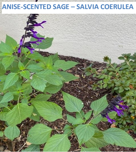
ANISE-SCENTED SAGE – SALVIA COERULEA