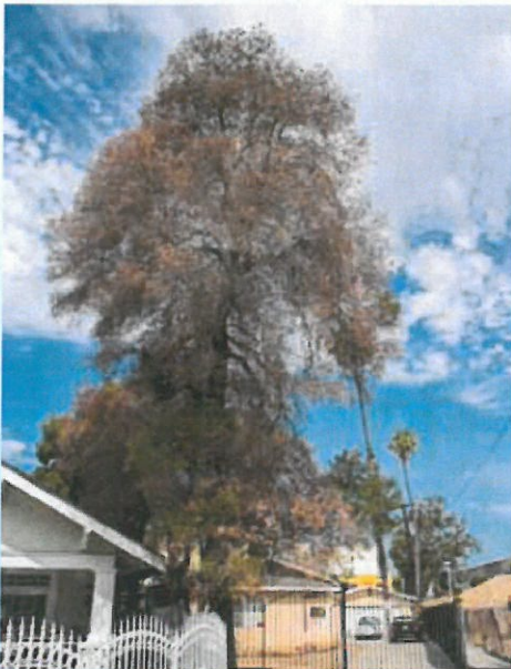
ABOVE: Drought-stressed tree

Look at the tree leaves. Wilting leaves is the first indicator of lack of water to the roots. It can also mean too much water, which is unlikely in this drought.