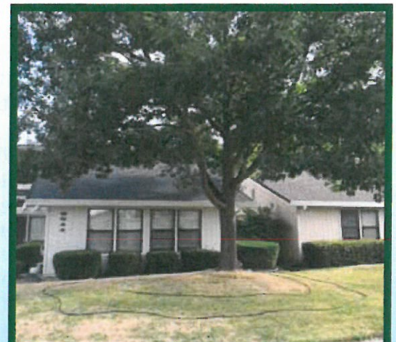
ABOVE: Place a soaker hose in a spiral pattern toward the edge of the tree canopy. Check the soil by plunging a long screwdriver or similar tool into the soil. BELOW: Watering Basin for young trees.

5. Mulch, Mulch, MULCH! 4 - 6 inches of mulch helps retain moisture, reducing water needs and protecting your trees.